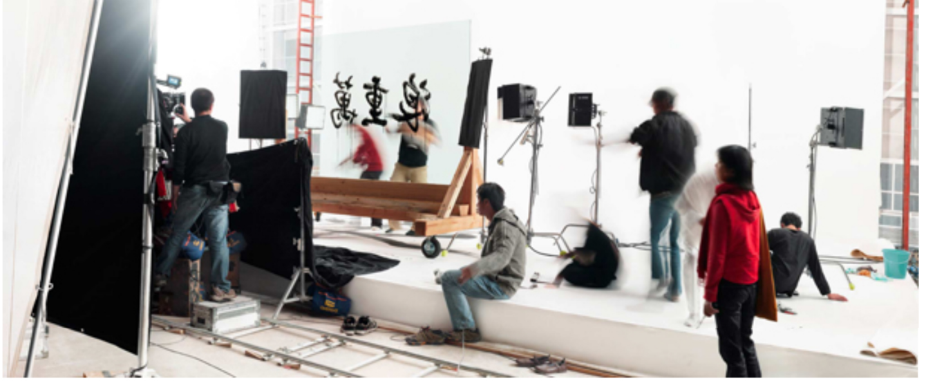
Isaac Julien, Mise-en-scene (Ten Thousand Waves) , 2010. Endura Ultra photograph, Diptych. Left side: 180 x 230 cm; right side: 218 cm x 180 cm.