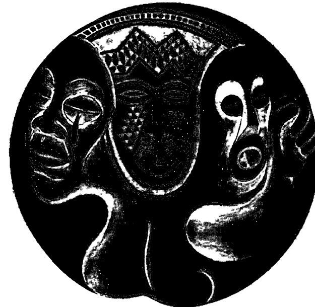
Figure 2.3 Judy Chicago, "Sojourner Truth Plate," The Dinner Party , 1979, porcelain.

The piece was shown again in 1996 as part of an exhibition in Los Angeles organized by feminist art historian Amelia Jones, for the UCLA Armand Hammer Museum, Los Angeles and more recently at the Brooklyn Museum in New York where it is now permanently housed. The UCLA Hammer exhibition and its accompanying catalogue were particularly significant because it was part of a wider project to rethink the reception of The Dinner Party in both feminist art