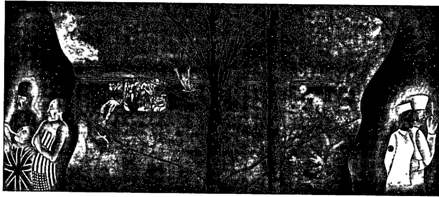
Figure 2.10 Judy Chicago with Donald Woodman, Wall of Indifference from The Holocaust Project , 1993, sprayed acrylic, oil paint, Marshall photo oil, and photography on photolinen, 43¼ × 96¼ in.

Ukeles's later work shows a continuing development of her ideas of maintenance art. By the late 1970s, she began to extend the references in her work beyond a purely feminist and Jewish context in order to reveal the conditions of work handed to maintenance workers in the New York City sanitation system, where she has her studio. In I Make Maintenance Art One Hour Every Day (1976), she worked for two months as part of the sanitation bureaucracy, cleaning floors and elevators in a lower Manhattan office building along with three hundred janitors and cleaning women. This was followed in 1980 by a large-scale performance titled Touch Sanitation that involved approximately 8,500 workers in the New York City Sanitation Department. Her project, which took eleven months to complete, was "to face and shake hands" with each one of the 8,500 sanitation workers while saying the words: "Thank you for keeping New York City alive." More recently, her work has broadened its focus on hygiene and maintenance work to the rethinking of environmental issues. 30 This later emphasis on actions outside of gallery or museum spaces, which puts her even farther on the margins of an art support system, runs concurrently with museum- or gallery-based work dealing specifically with questions of Jewishness.