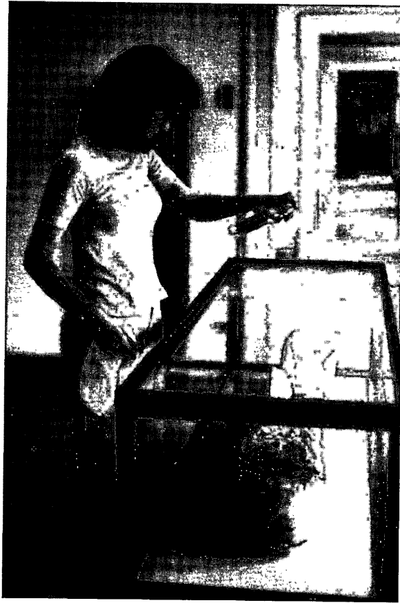
Figure 2.7 Mierle Laderman Ukeles, Cleaning Female Mummy Housed in Glass Case , part of Transfer: The Maintenance of the Art Object , 1973–74, Wadsworth Atheneum, Hartford, Connecticut. Photograph of performance.

like the maintenance of homes. In both cases, the labor (often feminized) is mostly unacknowledged and underappreciated yet critical for sustaining the daily existence of our lives. In the context of the museum, the work of janitors and cleaning women is done mostly by working-class laborers. The performance is meant to call attention to this labor force that ensures the smooth functioning of countless institutions in our communities but remains mostly hidden from view.