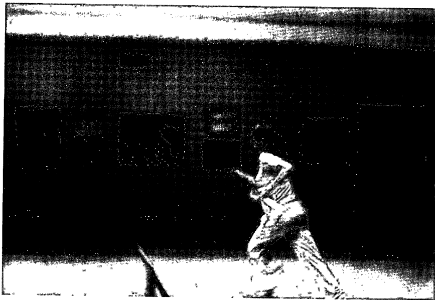
Figure 2.9 Mierle Laderman Ukeles, The Keeping of the Keys: Maintenance as Security , 1973, Wadsworth Atheneum, Hartford, Connecticut. Photograph of performance.

artists. This work details the daily hardships of a Tijuana maid working in San Diego, written from her point of view, and explores both the dependence of white middle-class women in southern California on the labor of Mexican domestics and the structural oppression of these laborers' lives. Both Ukeles and Rosler took a different trajectory than Chicago, exploring issues dealing with work, specifically blue-collar labor, pink-collar labor, and, in the work of Rosler, nonwhite labor. These works also provide a striking contrast to Chicago's Dinner Party , in which the work of maintenance – cooking, eating, and cleaning up – is absent altogether. Both Ukeles and Rosler are interested in work that is not recognized as such in the art world. Rather than focusing on a notion of the artist as “genius” in keeping with the ideal model of subjectivity offered by a discourse of conservative art history, they are instead concerned with the hidden labor that makes such a discourse of genius even possible.