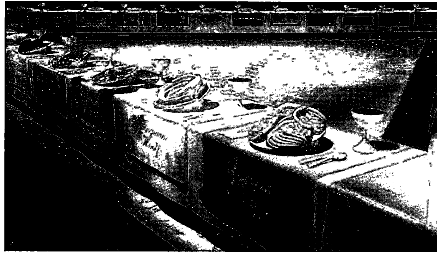
Figure 2.2 Judy Chicago, The Dinner Party , 1979, with the Virginia Woolf and Georgia O'Keeffe place settings in the foreground, mixed media.

The dinner party plates themselves all feature a butterfly or flower-like sculpture, representing a woman's vagina. These vulvar forms are meant to be emblematic of feminist heroines throughout history. Each place setting features a placemat with the woman's name and artworks relating to the woman's life, along with a napkin, utensils, a goblet, and a plate. The thirty-nine honorees at the dinner table itself are also symbolically represented through an elaborate needlework runner, in large part worked in techniques drawn from the period in which each woman lived (Figure 2.3). The room-sized sculpture was celebrated as the icon of 1970s feminist art when first exhibited. It was seen as quite groundbreaking at the time, in part because of its radical aesthetics that broke down this hierarchy between high and low, the fine arts and the crafts. Also, it validated the traditional activities of women, and connected the four hundred women working on the project with women who were important historically. The enormous artwork was a grand gesture to acknowledge these significant women and to honor them. However, the form this acknowledgment took, in putting emphasis on the women's sexuality, was anything but ordinary or conventional at that time.