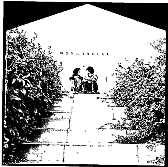
Figure 2.4 Judy Chicago and Miriam Schapiro at Womanhouse . Womanhouse catalogue designed by Sheila Lebrant de Brettville, 1971, mixed media installation.

The Dinner Party was seen in the late 1970s not in the ethnic and racial terms outlined above, but as part of the liberal critique of stereotypes in the 1960s and 1970s and as an instance of the positive feminist sexual imagery that was popular in the period, along with such slogans as “Sisterhood Is Powerful” and “Black Is Beautiful.” At that time, it was a common practice to regard images of women as merely reflections, good or bad, and to compare “bad” or “false” images of women (such as fashion advertisements) to “good” or “true” images of women. The best example of such an approach is the collaborative project Womanhouse (1972), organized by Judy Chicago and Miriam Schapiro with their twenty-one female students, at the California Institute of the Arts. Significantly, in this project all the students are named as artists of specific room installations in Womanhouse (Figure 2.4). The group of teachers and students took over and renovated an empty house in downtown Los Angeles and remade each of its rooms as a “true” dramatic representation of women’s experiences beginning in childhood: home, housework, menstruation, marriage, and so on (Figure 2.5). This was a significant