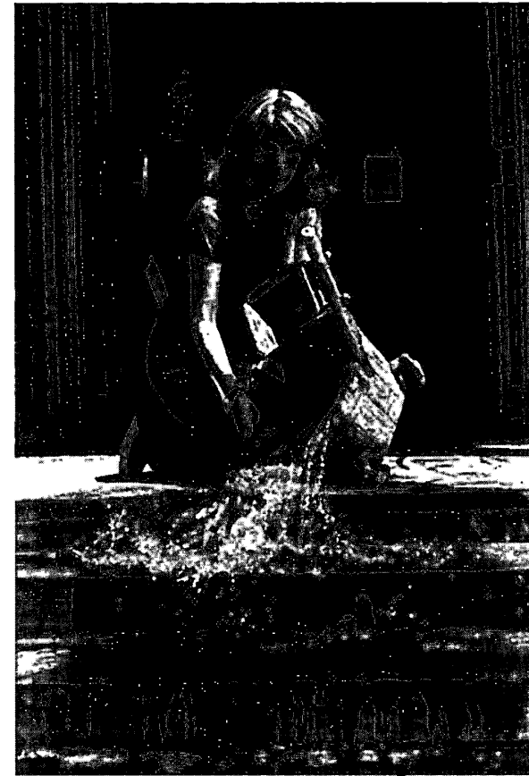
Figure 2.8 Mierle Laderman Ukeles, Hartford Wash: Washing, Tracks, Maintenance: Outside , 1973, Wadsworth Atheneum, Hartford, Connecticut. Photograph of performance.

In perhaps her most disruptive performance piece at the Wadsworth, titled The Keeping of the Keys: Maintenance as Security (Figure 2.9), Ukeles sealed off the entire museum, gallery by gallery, and took over the responsibilities of the museum guard whose position it was to maintain the security of the museum. This performance of locking and unlocking doors extended even to the curatorial offices during